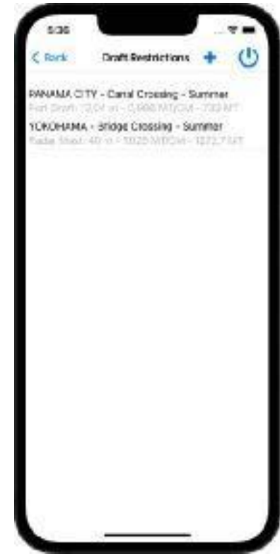
Chartering Case Restrictions