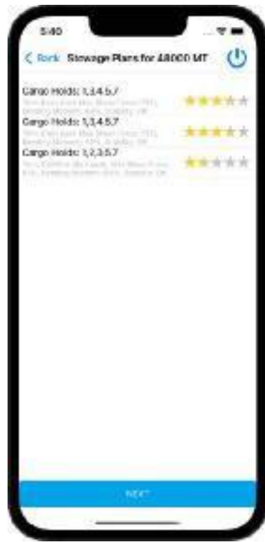
Chartering Case Results