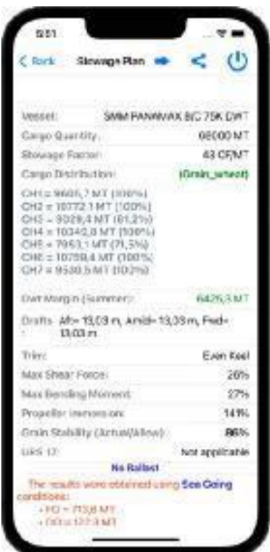
EasyLoad Stowage Plan