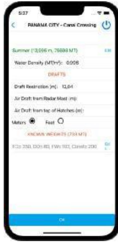
Chartering Case Restriction Details