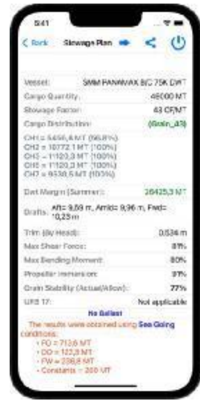
Chartering Case Stowage Plan