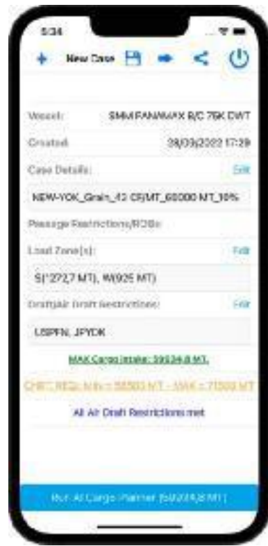
Chartering Case Overview