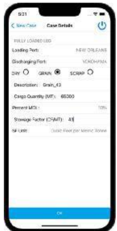
Chartering Case Details